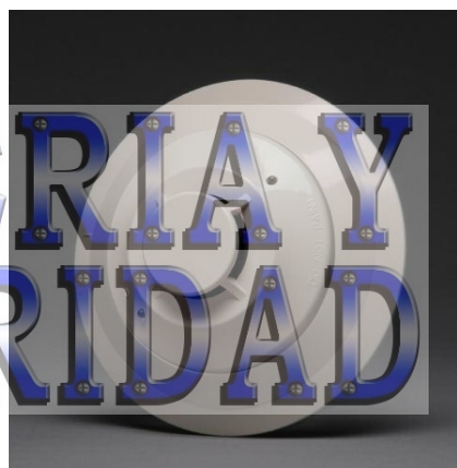
B210LP Base Installed with Detector