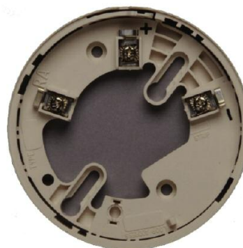
B501 Base Installed with Detector

This document is not intended to be used for installation purposes. We try to keep our product information up-to-date and accurate. We cannot cover all specific applications or anticipate all requirements. All specifications are subject to change without notice. For more information, contact Silent Knight 12 Clintonville Road, Northford, CT 06472-1610 Phone: (800) 328-0103, Fax: (203) 484-7118.