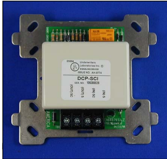
Back side of a DCP-SCI

The contractor shall furnish and install where indicated on the plans, the Hochiki DCP-SCI short circuit isolator. The modules shall be UL listed compatible with Hochiki Digital Communications Protocol (DCP) supporting control panel loops. The isolator module must be suitable for mounting in a standard 4" square electrical box or double gang. The isolator module must provide a yellow LED for indication of status.